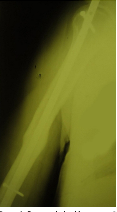
Figure 1. Decreased shoulder range of motion caused by nail protrusion out of the humeral head

In the month one (Visit A), sixth (Visit B), and 18th (Visit C) after surgery, each patient was examined by another surgeon. Complications were recorded and