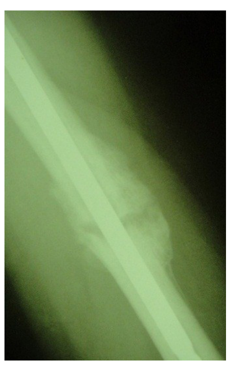
Figure 3b. Nonunion in a 52-year-old female with multiple fractures.