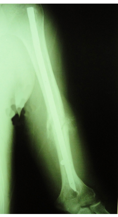
Figure 2. Elbow limited range of motion caused by nail protrusion into the olecranon fossa.

shoulder subjective outcome was evaluated using a combination of the Constant Shoulder Score, Short Form Questionnaire (SF-36).