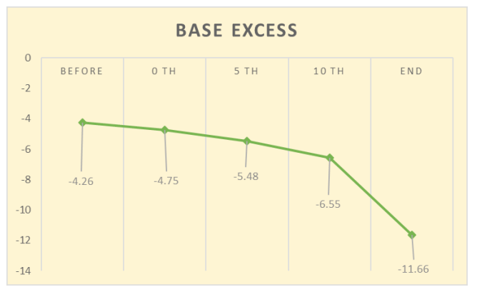
Figure 2. Changes in base Excess during cementation.

form hardened PMMA in an exothermic reaction. The end result is a soft, pliable, doughy material which then hardens into a cement-like PMMA complex (13).