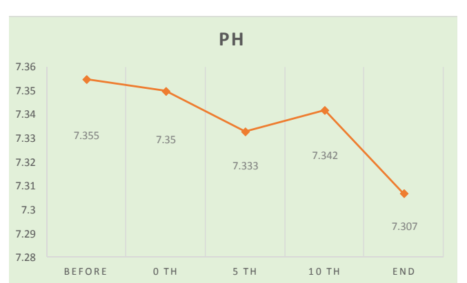
Figure 1. Changes in pH during cementation.