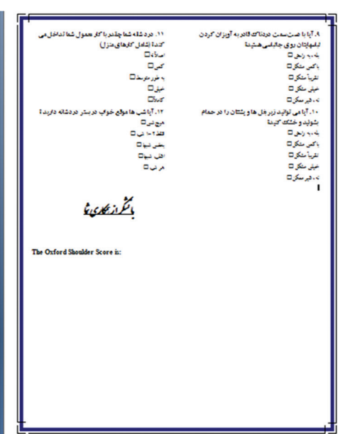
Figure 1: Persian version of Oxford Shoulder Score that is validated for Persian speaking population.